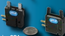
Series GRA Compact Precision Parallel Pneumatic Gripper