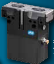
Series EGRK Parallel Electric Gripper