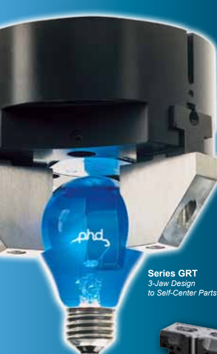
Series GRT 3-Jaw Design to Self-Center Parts