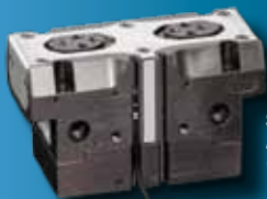
Series GRK Parallel Pneumatic Gripper