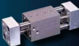
Series GRW Low Profile Parallel Gripper with Minimal Jaw Play