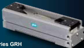
Series GRH Long Jaw Travel, Low Profile Parallel Gripper with Large Moment Capacities