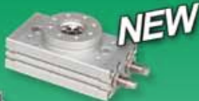
Series ORQ Compact Rotary Table - 6 Sizes - Standard adjustment screws with integral shock pads