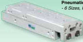
Series OSW Dual Bore Pneumatic Table Slide - 6 Sizes, Incremental Travels