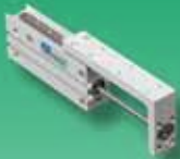
Series OSH Compact Pneumatic Slide Table - 4 Sizes, Incremental Travels

PHD, Inc. is setting a new standard in pneumatic actuators. PHD Optimax® products are designed and tested to meet the demands of the industrial market for optimum price savings. These economical, efficient and reliable actuators complement PHD's option-rich product lines.