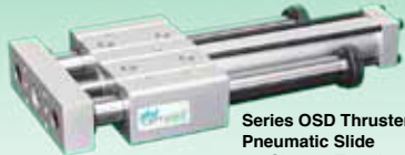
Series OSD Thruster Pneumatic Slide - 3 Sizes, 4 Travels