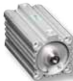
Series OCQ Pneumatic Compact Cylinders - 10 Sizes, Incremental Travels