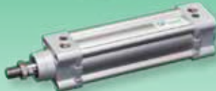
Series OCV Pneumatic ISO Cylinder - 3 Sizes, 4 Strokes