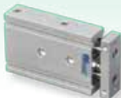
Series OSX Light Duty Pneumatic Slide - 5 Sizes, 7 Travels