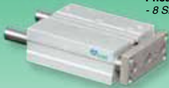
Series OSP Compact Pneumatic Thruster Slide - 8 Sizes, Incremental Travels